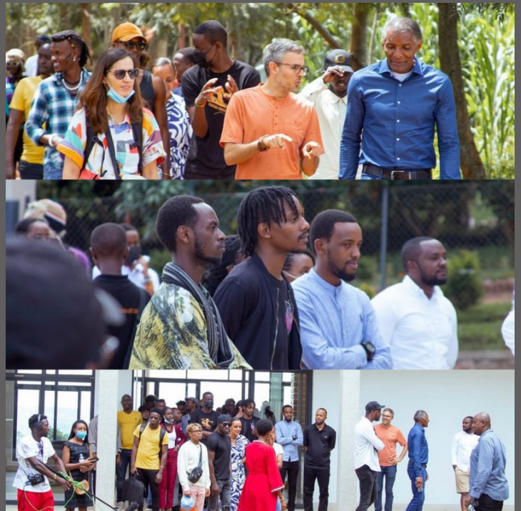
TOUR AROUND THE CENTER